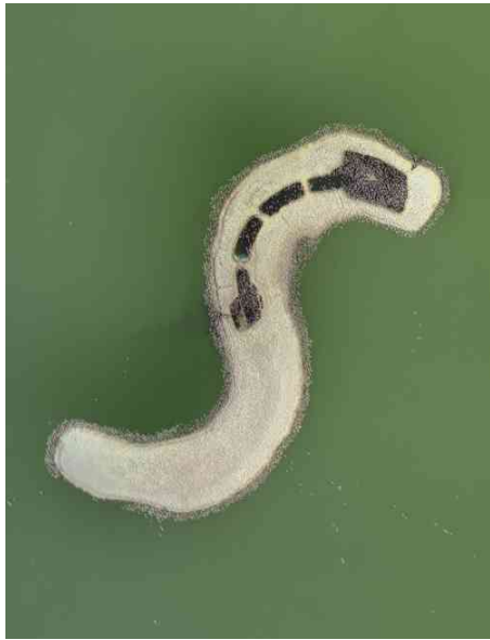
Aerial photograph of the flamingo island. The island is covered (literally wall to wall) with Lesser Flamingos.