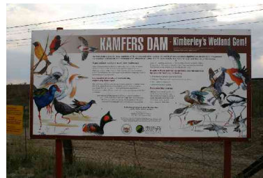
Information board about Kamfers Dam and its waterbirds.