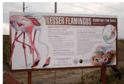
Information board about Kamfers Dam's Lesser Flamingos.