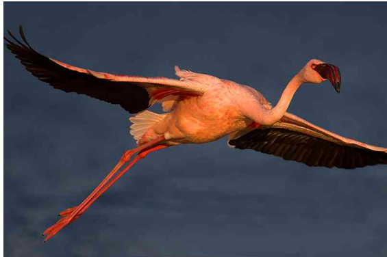
A Lesser Flamingo photographed at Kamfers Dam during June 2007.

During the recent survey 50 693 waterbirds of 86 species were counted at 61 Northern Cape wetlands.